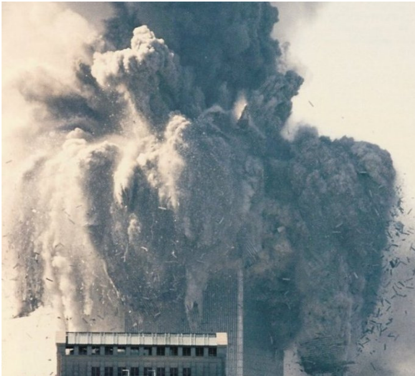
Figure 1. Explosive dust cloud from the North Tower, which clearly shows large metal pieces like cladding and beams in the air. (After Jim Hoffman in [1].)

Claims have been made that there is no direct proof that explosions occurred in the World Trade Center on September 11, 2001, but there are in fact visible photographs of collapse results that provide that proof. One such photograph posted in late 2005 is shown in Figure 1, which shows the rapidly expanding cloud of the North Tower that directly exhibits explosions shattering material with hundreds of pieces of metal cladding and beams flying in the air at the edge of the dust cloud. However, there is also a whole set of photographs posted on the web which can be shown through physics calculations to graphically exhibit the direct effects of explosions in the World Trade Center towers, yet these facts have not been previously investigated.