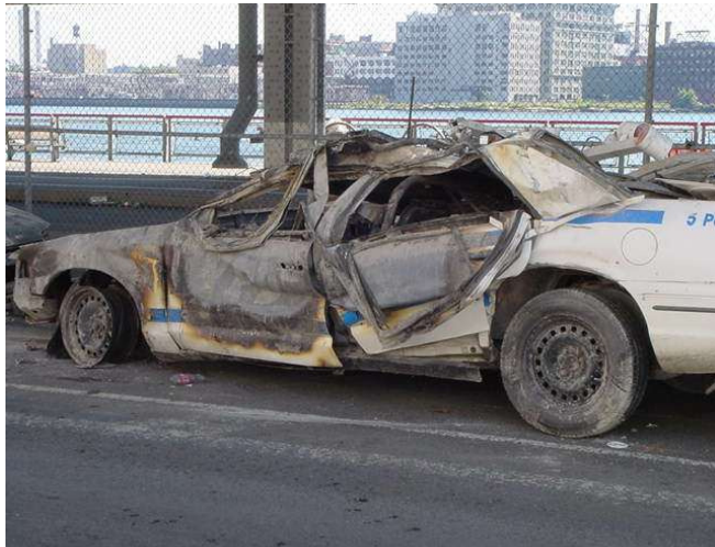
Figure 2. Vehicle damaged by World Trade Center explosions. (From [2].) Note that the uneven bending and twisting of metal, shattered windows, and swath of surface damage over a large area of metal. This combination of damage strongly suggests it was hit with force by a wide stream of debris which was apparently hot and possibly corrosive to the metal. This car was located on FDR Drive, and (reference [4]) was evidently towed to that location.

Photographs for the case that I claim clearly provide proof that multiple explosions occurred, but have never been presented as such, are shown in Figures 2 and 3. The figures show cases of unmistakable evidence of damage from the World Trade Center collapses. These are just 2 examples of many cars that were pelted and devastated by such material from the collapsing World Trade Center buildings. Photos of many of these cars were posted by Prof. Judy Wood, who claims that they show damage from directed-energy laser-beam weapons. The laser-beam proposal was strongly challenged recently, although without proposing alternative models. Neither described the cause examined here. [2,3]