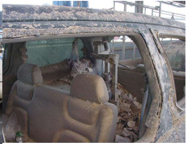
Figure 3. Vehicle damaged by World Trade Center explosions posted in reference [2]. The material caked on the exterior as well present inside the car apparently came from debris material streaming at high-speeds, shattering the windows. The seat has some projectile material on it, but was largely undamaged, probably because the car metal shielded it from any direct hit. The vehicle does not exhibit fire or heat damage.

The video frame in Figure 4 of the World Trade Center North Tower taken by KTLA channel 5 news shows a "squib" -- a line of ejecting material from the tower -- right before it collapsed. Such squib ejections are driven by massive overpressure inside the building relative to the atmospheric pressure outside, and that overpressure is created by explosions. A number of squibs were observed coming from all 3 of Buildings 1, 2, and 7 a short second or 2 after each one started to collapse, and there are several websites that show photograph of them on all 3 buildings. The one displayed as Figure 4 shows ejecting material (bits of material large enough to have little air resistance) streaming out of the North Tower, which has traveled a distance from the tower in the horizontal direction, whereas the distance it has descended in the vertical direction because of gravitation pull is small.