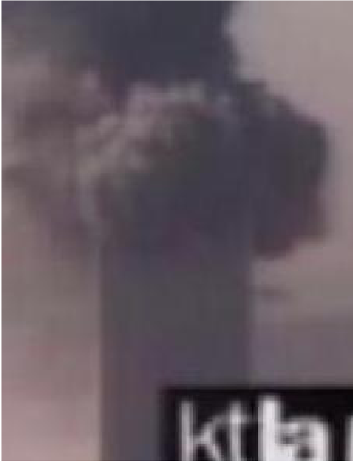
Figure 4. Photograph from a video of the North Tower collapse by KTLA channel 5 news, which shows a streaming squib that has traveled out over 70 feet from the tower with very little descent [5].

Note the quantitative information that can be gathered from the ejection photograph in Figure 4. We can estimate that, at the front end, the ejecting plume has apparently fallen no more than roughly 3 feet (an estimate that might have up to a factor of 2 in error), whereas the horizontal distance of the front from building is about 1/3 the width of the North Tower, or about 70 feet. If we neglect air friction resistance over the length of the streamer, from fall distance s=0.5gt^2 , where g=32 feet/sec 2 is the gravitational acceleration, we estimate 0.43 sec as the time since the front end first ejected from the building. That means that material in that squib is traveling horizontally at roughly 163 feet/sec, which means the squibs are effectively "bullets" of bits of material produced by the explosions. Since the distance fallen is quite small there may be a fairly large uncertainty in its estimate. Allowing for an error of up to a factor of 2 in the measurement of the fall distance s , the velocity could be down to 41% lower or up to 30% higher, so it could range from 100 feet/s to over 200 feet/s.